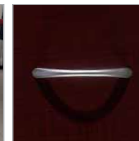
Contemporary bow shaped handles are standard on all drawers and doors and are offered in Silver or Black Nickel